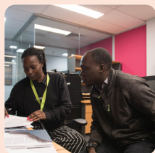
The World of Biz & Tech