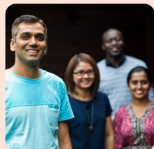
History, Culture & Diversity