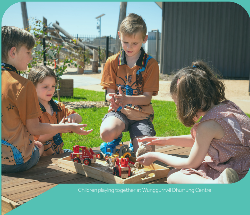
Children playing together at Wunggurrwil Dhurrung Centre