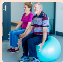
Wellbeing & Personal Development