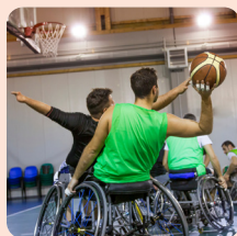
Sports & Recreation