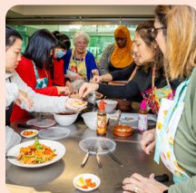
Food & Cooking