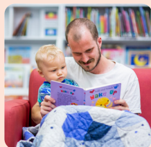
Families & Children