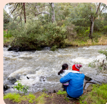
Environment & Sustainability