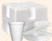
Bagged polystyrene & foam