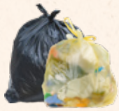
Bagged General Rubbish