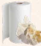
Paper towel & tissues