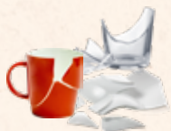
Broken glassware & crockery