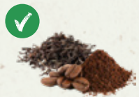
Loose leaf tea & coffee