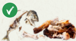
Seafood, meat & bones