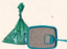
Kitty Litter and Animal Waste