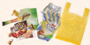
Plastic bags, Soft plastic packaging & food wrappers