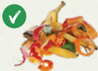
Fruit & vegetable scraps