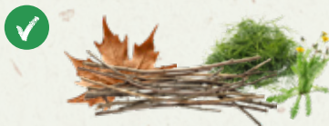
Garden waste; lawn clippings, small branches, leaves & weeds