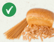
Bread, pasta, rice & cereals