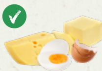
Dairy & eggs