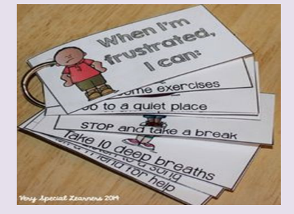
For more information about the Zones of Regulation <a href="https://www.zonesofregulation.com/learn-more-about-the-zones.html">https://www.zonesofregulation.com/learn-more-about-the-zones.html</a>

There is also a vast array of information that can be found on Google or educators can contact the Wyndham PSFO Team for info/resources – psfo.service@Wyndham.vic.gov.au