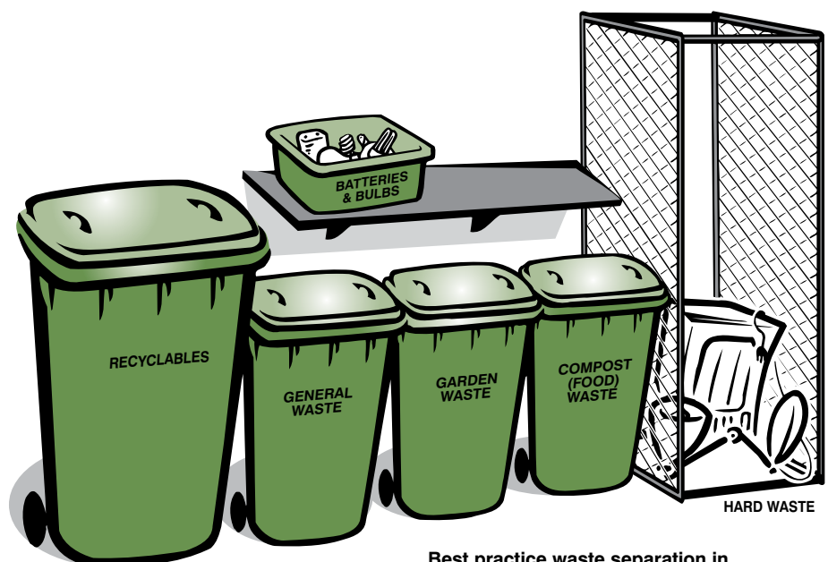
Best practice waste separation in multi-unit residential developments.

Construction sites can represent a great burden on local waterways. Site litter, paint, solvents, bricks, cleaning substances and clean-fill can all contaminate stormwater runoff. It is an offence under the Environment Protection Act to discharge contaminated water into the stormwater system. To avoid contamination, ensure that a drainage system is installed before construction activities commence and storm water is diverted from areas where soil is exposed.