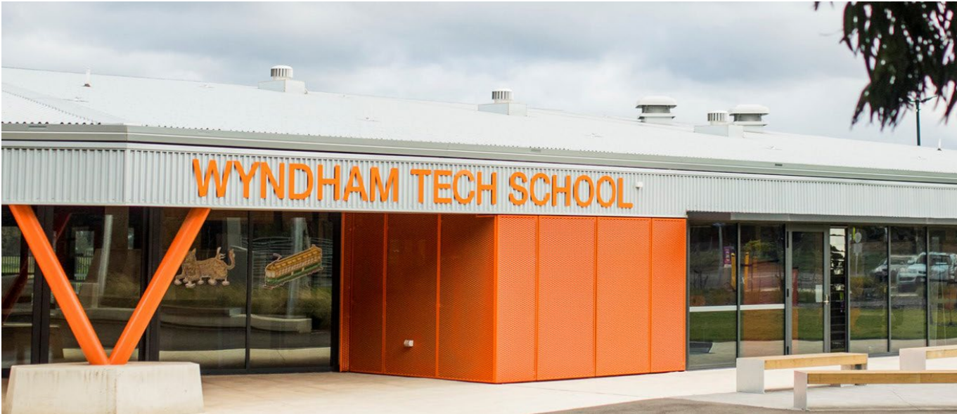
Wyndham Tech School