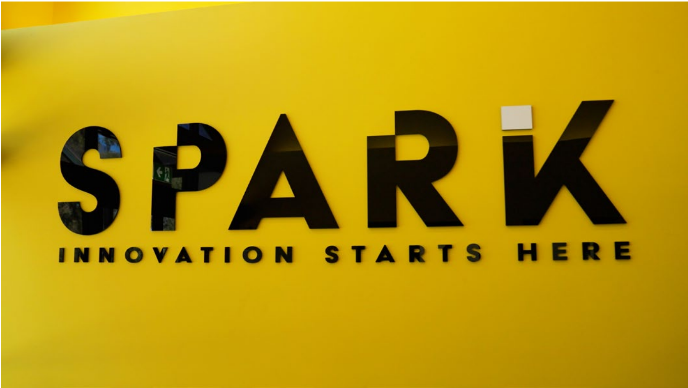
SPARK - Wyndham City's Innovation Hub