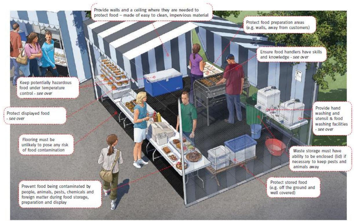
This document is for guidance only and is not legally binding. Each premises will be assessed on its own individual food safety risks by the relevant local enforcement agency. Other requirements may also apply (e.g. LPG use, fire control, waste disposal) — seek advice from your local enforcement agency.