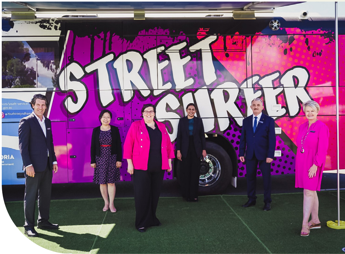
Above: Wyndham Councillors at the launch of the Street Surfer Bus.