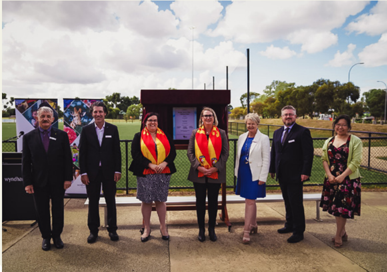
Above: Wyndham Councillors and the Member for Tarneit Sarah Connolly MP at the opening of the Grange Reserve Pitch 1 Lighting Project.

The following tables outlines some of the external committees, forums and meetings attended by Wyndham City in 2020 21.