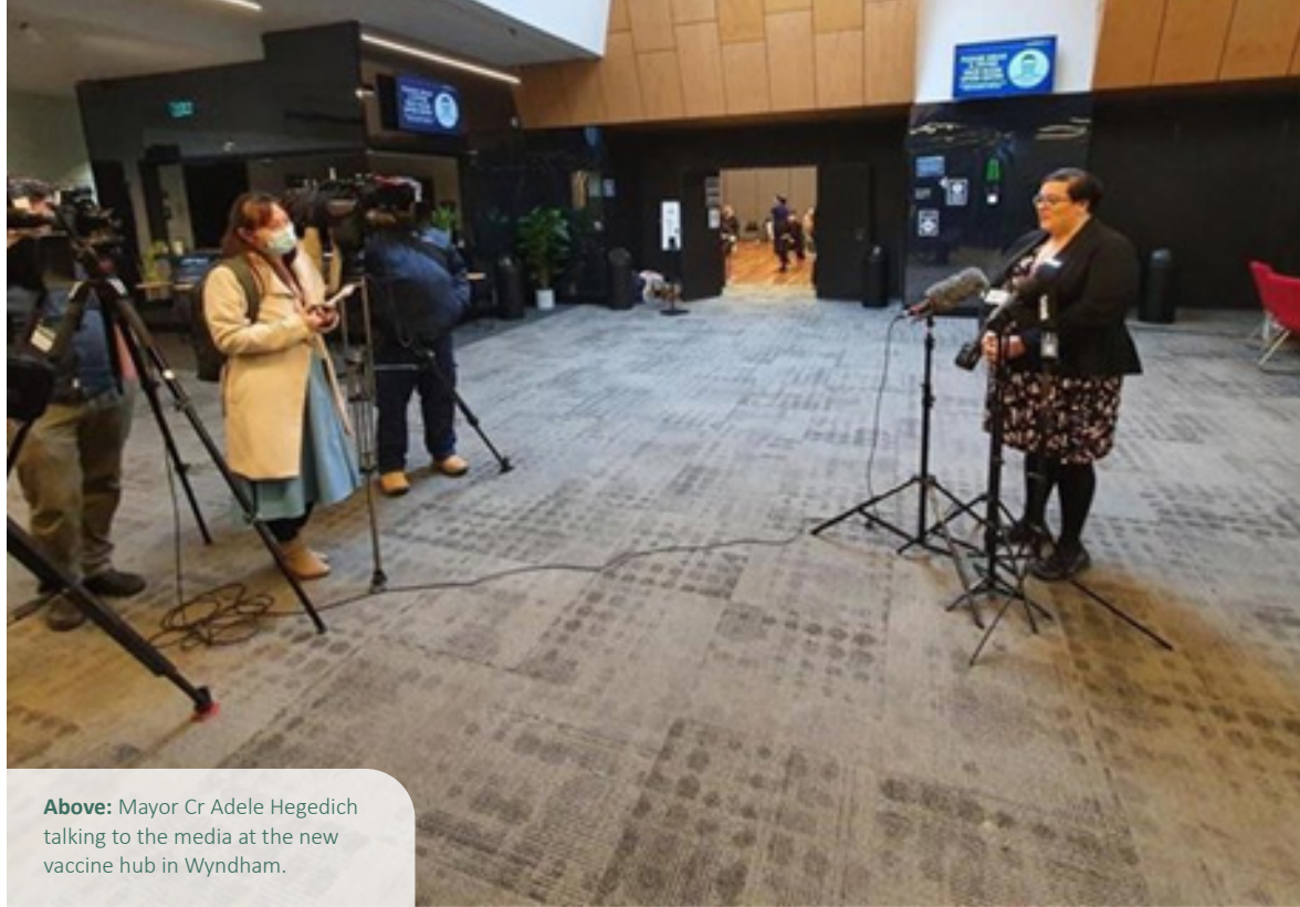
Above: Mayor Cr Adele Hegedich talking to the media at the new vaccine hub in Wyndham.