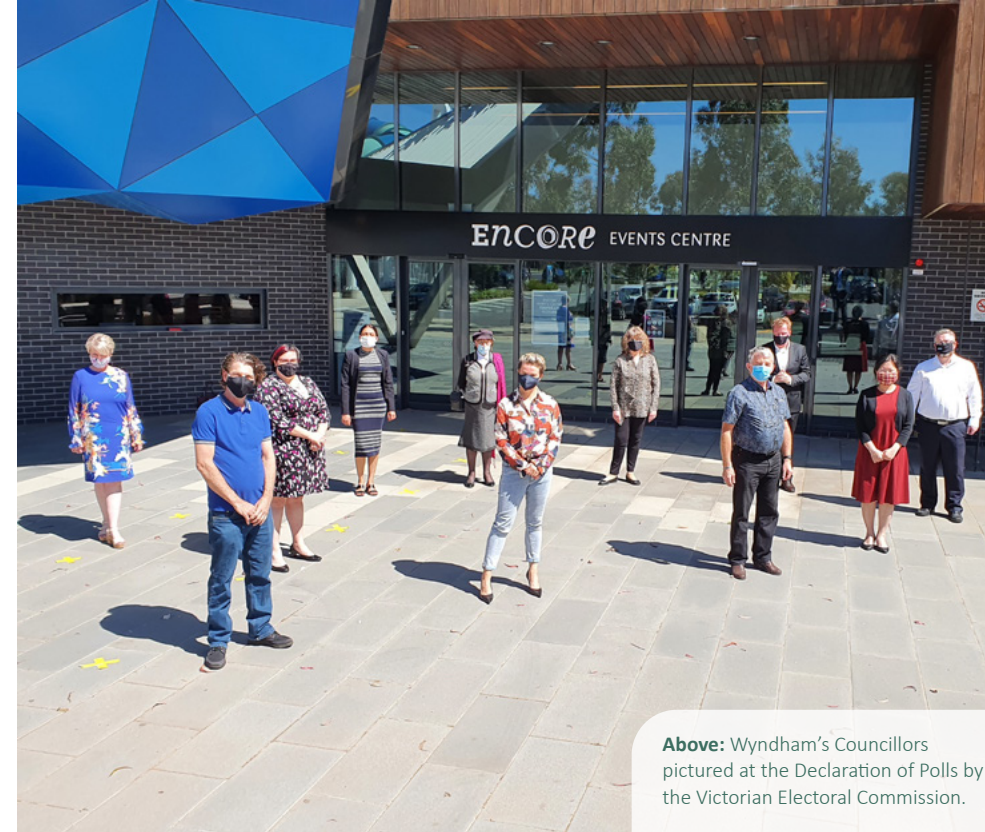
Above: Wyndham's Councillors pictured at the Declaration of Polls by the Victorian Electoral Commission.