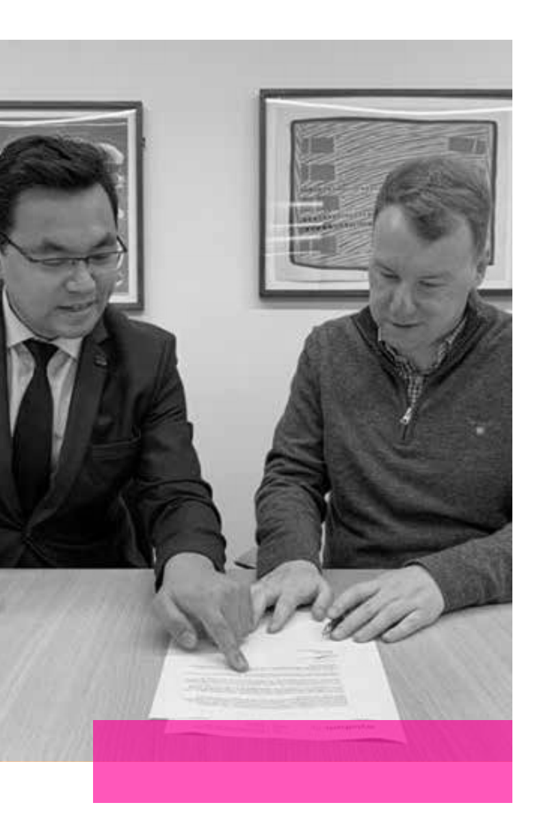
CR AARON AN AND MAYOR CR JOSH GILLIGAN WRITING TO THE MINISTER FOR EDUCATION JAMES MERLINO REGARDING THE PROVISION OF SCHOOLS IN WYNDHAM

In 2019/20, Wyndham City undertook strong engagement with community groups, community members, the State and Federal Government, Members of Parliament, government department officers, and key stakeholders.