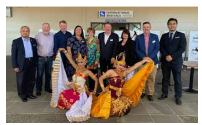
WYNDHAM CITY AND GREATER GEELONG COUNCILLORS AT THE CELEBRATION OF ADDITIONAL INTERNATIONAL FLIGHTS AT AVALON AIRPORT.

As the response to the pandemic continues to develop, Wyndham City will look for opportunities to work in collaboration with other levels of government and other councils in our region to support our local economy. We are already working with other western