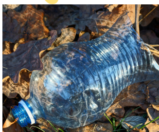
Piece of rubbish

Get your running shoes on and head outdoors! See who can find all of the objects the quickest! As you find an item cross it off your list. The first person to find everything wins!