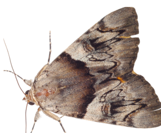
Moth or Butterfly