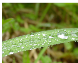
Blade of grass