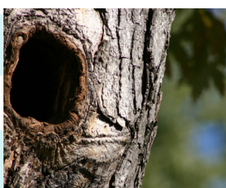
A hole in a tree