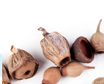
Seed or Seed Pod