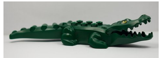
For your pets