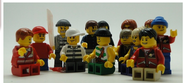
For the whole family.