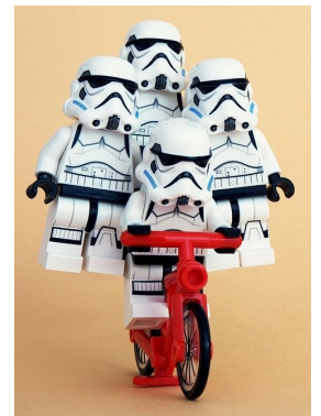
For your friends.