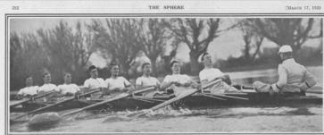
THE STRUGGLE OF THE "BLUES."