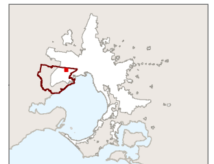
Part of Planning Scheme Map 4PAO