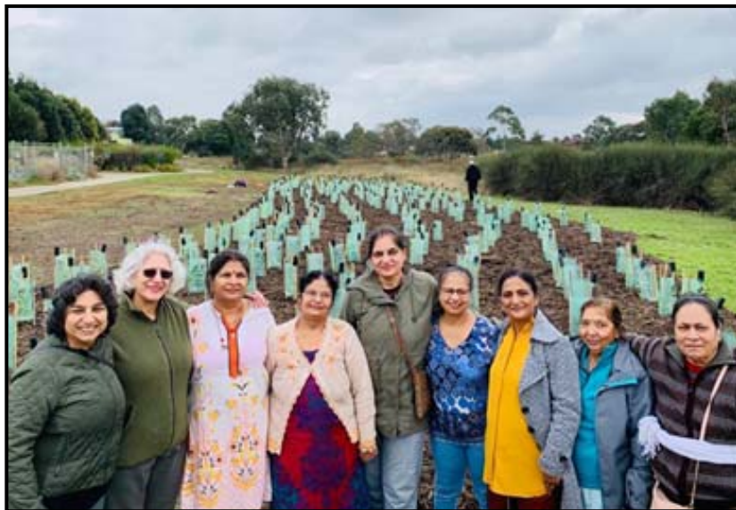
Pictured above: members of the Active Young 55+

participants are learning new skills, meeting new people, improving their local area and being able to undertake activities they may not have opportunity to do in their own backyards. Groups have the opportunity to care for their local area all while helping to create vibrant, welcoming and sustainable open spaces and of course have fun. Other than beautifying areas trees offer many other benefits such as helping to combat climate change, providing clean air and oxygen, the provision of shade and habitat for wildlife.