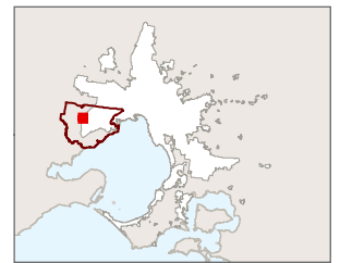
Part of Planning Scheme Map 9ESO