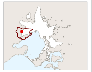
Part of Planning Scheme Map 9EAO

Disclaimer This publication may be of assistance to you but the State of Victoria and its employees do not guarantee that the publication is without flaw of any kind or is wholly appropriate for your particular purposes and therefore disclaims all liability for any error, loss or other consequence which may arise from you relying on any information in this publication.