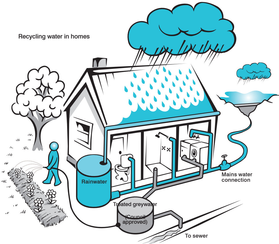
Recycling water in homes

“I was surprised how easy recycling water actually is. Once you understand the different sources, usages and quantities, it just makes common sense.”