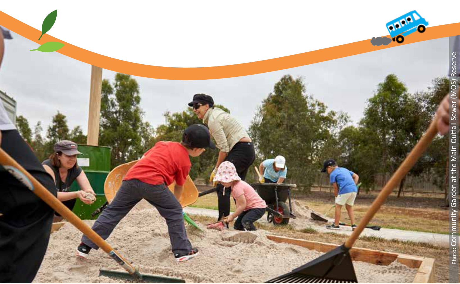
Photo: Community Garden at the Main Outfall Sewer (MOS) Reserve