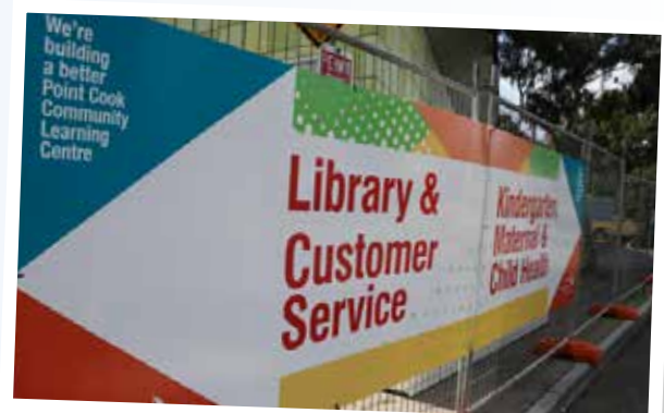
Point Cook Community Learning Centre