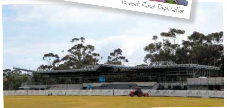
Chirnside Park Redevelopment