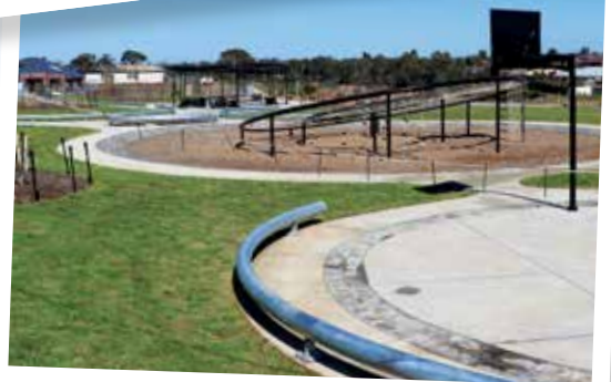
Talliver Terrace Park and Skeleton Creek Bridges