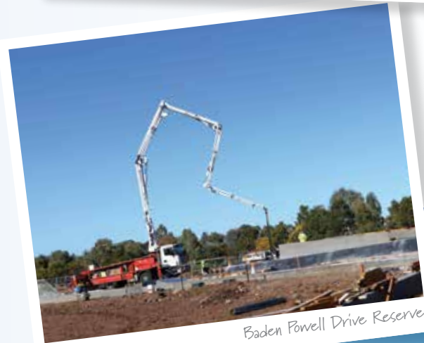
Baden Powell Drive Reserve