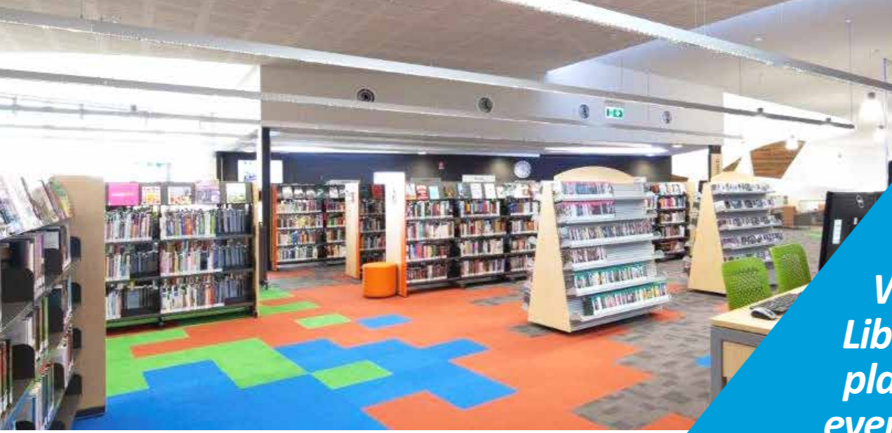
Julia Gillard Library Tarneit

Wyndham Libraries – A place where everyone can learn, connect and grow.