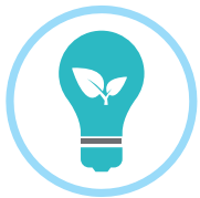
Portfolio: Environment and Sustainability

The Environment and Sustainability Portfolio is responsible for contributing to the development of strategies that will help achieve the Sustainability targets as part of the Wyndham 2040 Plan and provides advice on programs for habitat conservation, recycling and responsible pet ownership.