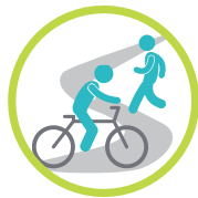
Portfolio: Sports Development

The Sports Development Portfolio is responsible for promoting active lifestyles and provides advice on the provision of sports facilities and working to build support for emerging sports and clubs.