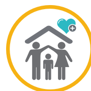
Portfolio: Family Friendly City

The Family Friendly City Portfolio is responsible for assisting in the development of strategies that will improve the liveability for all people and to support the health and wellbeing of families.