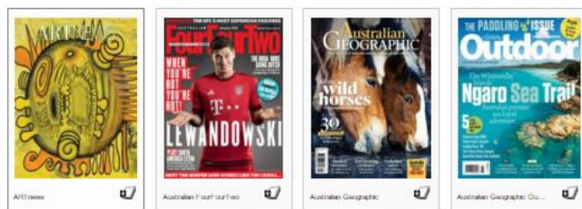
Sample magazine titles available