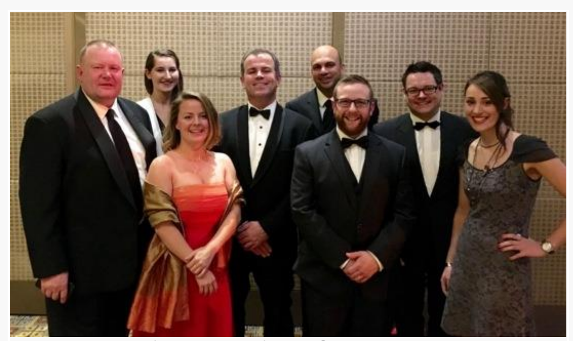
ebm-papst at Manufacturing Hall of Fame Gala Dinner 2016