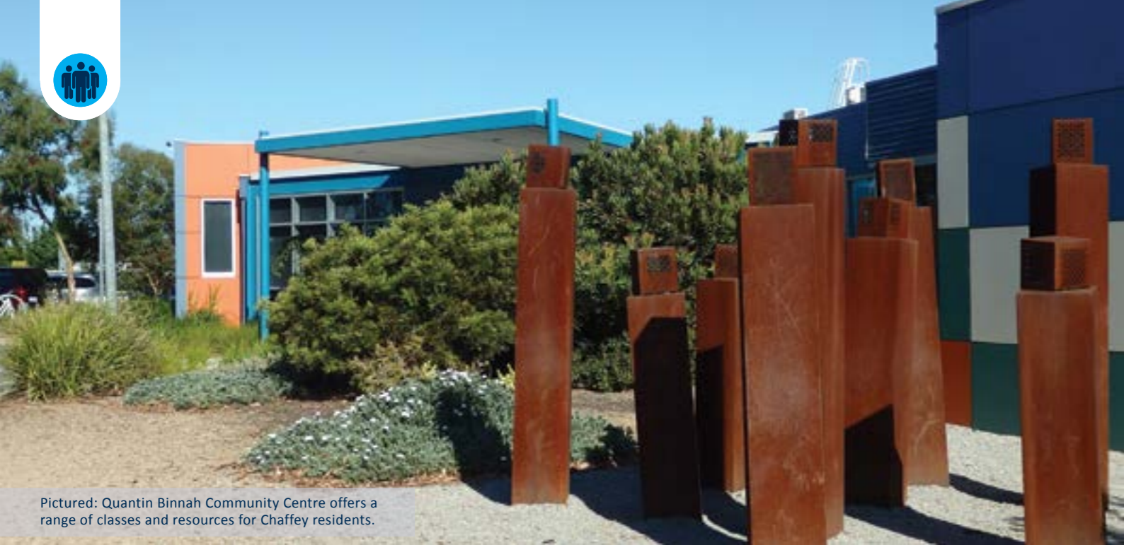
Pictured: Quantin Binnah Community Centre offers a range of classes and resources for Chaffey residents.