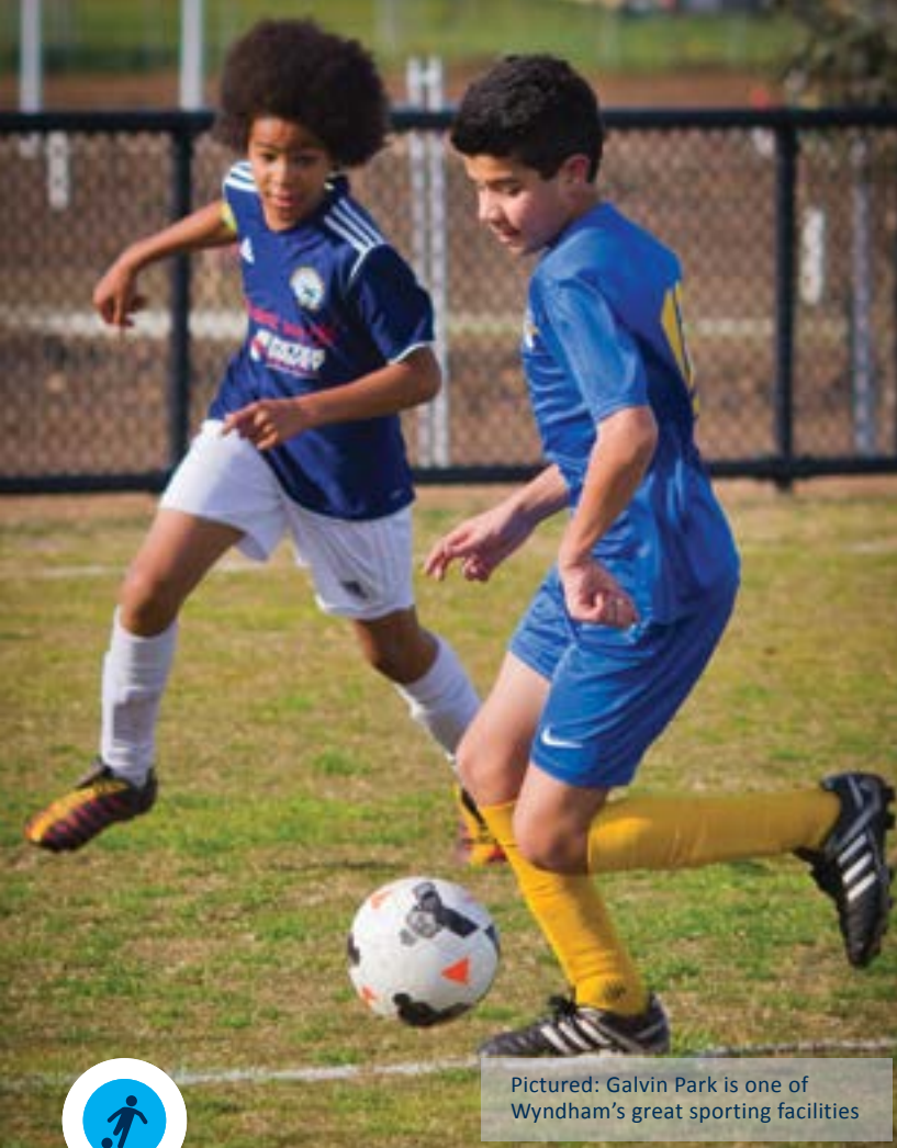
Pictured: Galvin Park is one of Wyndham's great sporting facilities