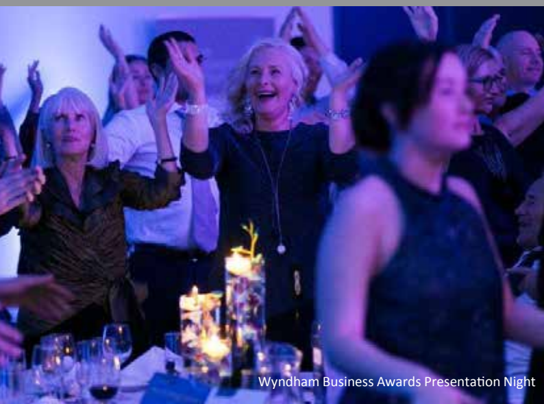
Wyndham Business Awards Presentation Night