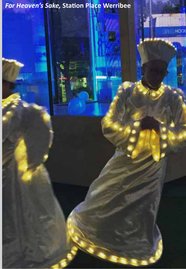
For Heaven's Sake, Station Place Werribee

Orange Leaf loves to support the Werribee community by offering multiple discounts. You will receive a 10% discount if you come into the store with your school uniform while Wednesday is fill your cup day for a flat rate of $5.00. This and many other special discounts are available from Monday to Friday from midday until 9pm and on weekends from 2pm until late. For more information visit www.orangeleafyogurt.com.au or pop into Shop 5/70 Watton Street Werribee.