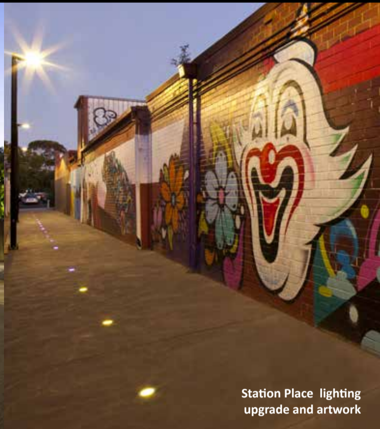
Station Place lighting upgrade and artwork