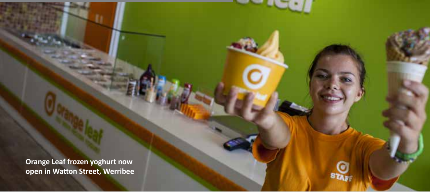
Orange Leaf frozen yogurt now open in Watton Street, Werribee