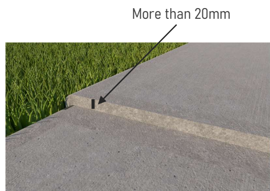
Proposed intervention level